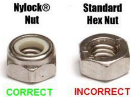
Figure 2: Nylon Locking Versus Standard Nut

If the step is not assembled with a standard nut, please arrange to have the nuts replaced with nylon locking nut at your designated service center.